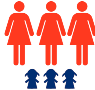
Women and girls trafficked for forced labor are highly vulnerable to sexual violence and/or exploitation.

UNODC Global Trafficking in Persons Report 2018